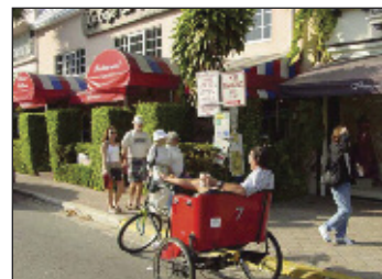
Las Olas Boulevard

For more information on shuttle schedules and trip planning services, visit www.tri-rail.com or call 1-800-TRI-RAIL.