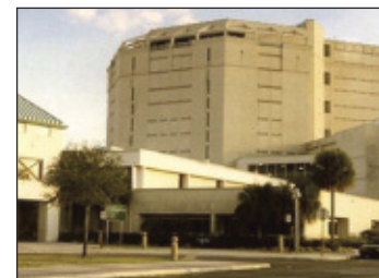
Palm Beach County Sheriff's Office