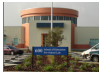
Miami-Dade College, North Campus