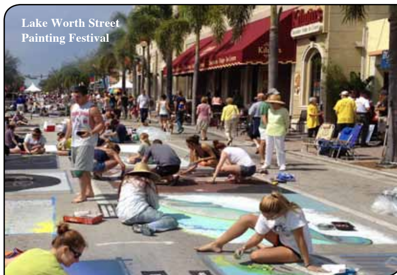
Lake Worth Street Painting Festival

This year, the free event will also have free shuttle service from Tri-Rail's Lake Worth Station throughout the event, between 10 a.m. and 6 p.m. on Saturday and Sunday, February 23 and 24, and will be staged at its usual location along Lake and Lucerne Avenues in Downtown Lake Worth. Visit www.streetpaintingfestivalinc.org for more information.