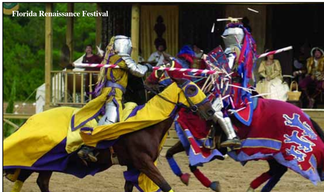
Florida Renaissance Festival

crafts, food fit for a king and more. The festival takes place from 10 a.m. to sunset on Saturdays and Sundays, as well as on President's Day. Tri-Rail's Street Team will be there on opening weekend, so be sure to stop by and say hello. For tickets and additional information, please visit www.ren-fest.com or call 954-776-1642.