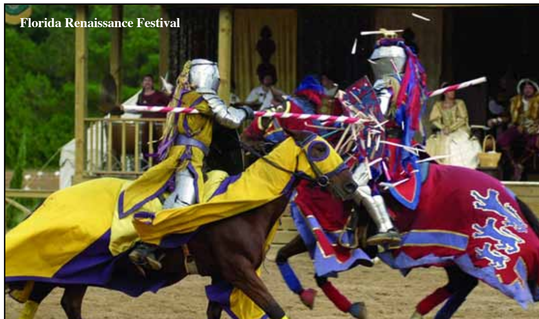
Florida Renaissance Festival

crafts, food fit for a king and more. The festival takes place from 10 a.m. to sunset on Saturdays and Sundays, as well as on President's Day. Tri-Rail's Street Team will be there on opening weekend, so be sure to stop by and say hello. For tickets and additional information, please visit www.ren-fest.com or call 954-776-1642.