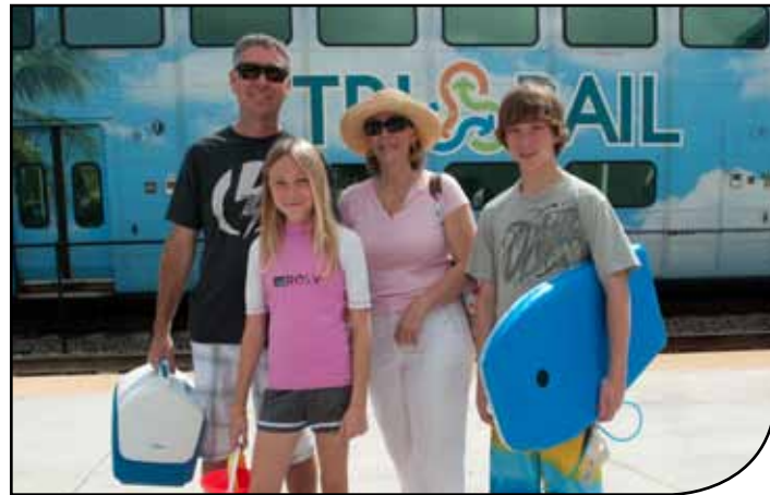
With expanded weekend service, it will be easier than ever to get to the beach, sporting events local attractions and more.

SFRTA kontan pou anonse apati 2 mas 2013, sèvis Tri-Rail nan jou wikenn pral ogmante pou sòti nan 16 tren pou pase a 30 tren, pou amelyore kantite fwa ant sèvis dezèdan ki genyen kounye a nan jou wikenn ak jou ferye. Chanjman an ap gen ladan tou sèvis tren byen tan pandan jou sa yo, pou pi byen satisfè bezwen moun Sid Florida ki pral nan evènman, pasaje ayewopò ak moun ki travay nan wikenn.