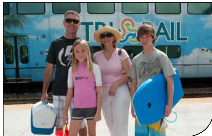
With expanded weekend service, it will be easier than ever to get to the beach, sporting events local attractions and more.

SFRTA kontan pou anonse apati 2 mas 2013, sèvis Tri-Rail nan jou wikenn pral ogmante pou sòti nan 16 tren pou pase a 30 tren, pou amelyore kantite fwa ant sèvis dezèdan ki genyen kounye a nan jou wikenn ak jou ferye. Chanjman an ap gen ladan tou sèvis tren byen tan pandan jou sa yo, pou pi byen satisfè bezwen moun Sid Florida ki pral nan evènman, pasaje ayewopò ak moun ki travay nan wikenn.