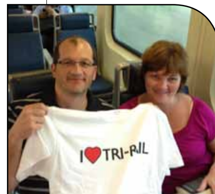
Visit the E-store at www.tri-rail.com/shop to purchase your own “I Love Tri-Rail” t-shirt.

Commuters who rode Tri-Rail on Valentine’s Day fell in love with the commuter rail system. Cupid joined radio personalities from WBGG-FM, WMGE-FM and WOLL-FM onboard select trains and gave lucky riders the chance to win great prizes.