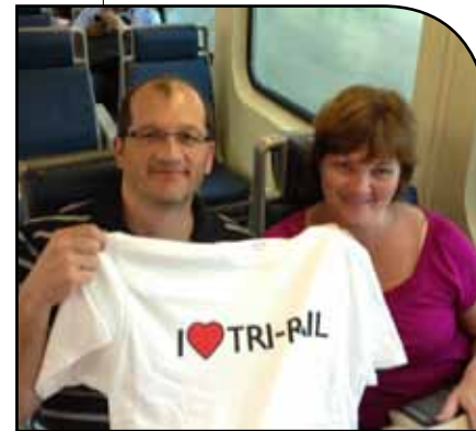
Visit the E-store at www.tri-rail.com/shop to purchase your own “I Love Tri-Rail” t-shirt.

Commuters who rode Tri-Rail on Valentine’s Day fell in love with the commuter rail system. Cupid joined radio personalities from WBGG-FM, WMGE-FM and WOLL-FM onboard select trains and gave lucky riders the chance to win great prizes.