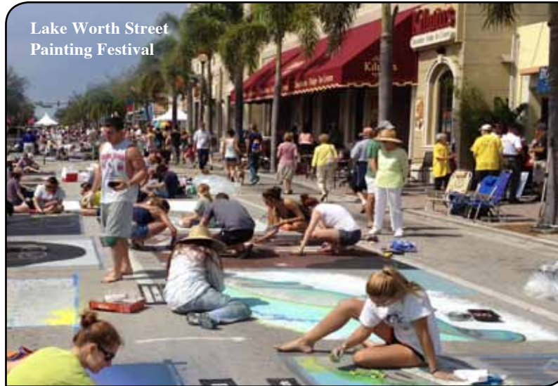
Lake Worth Street Painting Festival

This year, the free event will also have free shuttle service from Tri-Rail's Lake Worth Station throughout the event, between 10 a.m. and 6 p.m. on Saturday and Sunday, February 23 and 24, and will be staged at its usual location along Lake and Lucerne Avenues in Downtown Lake Worth. Visit www.streetpaintingfestivalinc.org for more information.