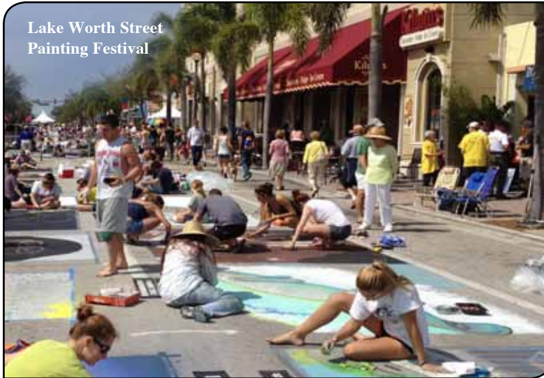
Lake Worth Street Painting Festival

This year, the free event will also have free shuttle service from Tri-Rail's Lake Worth Station throughout the event, between 10 a.m. and 6 p.m. on Saturday and Sunday, February 23 and 24, and will be staged at its usual location along Lake and Lucerne Avenues in Downtown Lake Worth. Visit www.streetpaintingfestivalinc.org for more information.