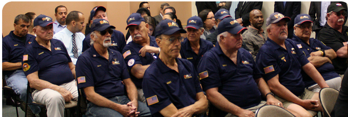
Members of the Disabled American Veterans Gold Coast Chapter 133 at SFRTA Governing Board Meeting

Eleven of the twelve new locomotives the SFRTA purchased are in-house and undergoing testing prior to being put into service. The goal is to place a new engine into service approximately every two weeks.