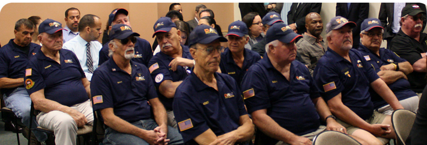
Members of the Disabled American Veterans Gold Coast Chapter 133 at SFRTA Governing Board Meeting